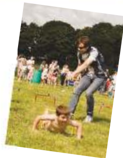
FAMILY FUN DOG SHOW