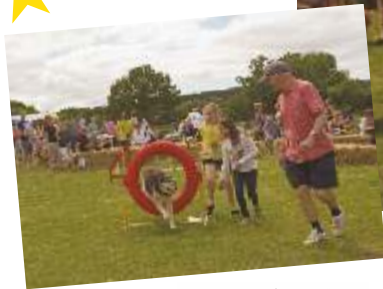
DOG AGILITY COURSE