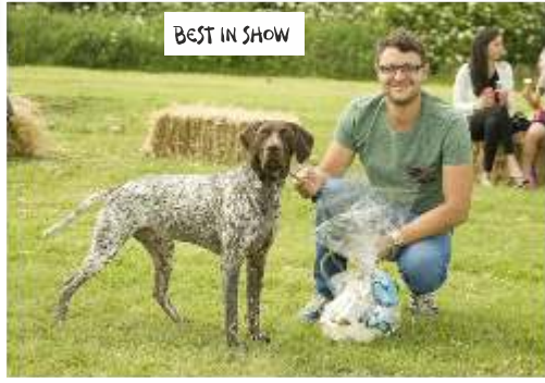
BEST IN SHOW