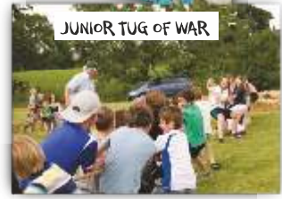
JUNIOR TUG OF WAR