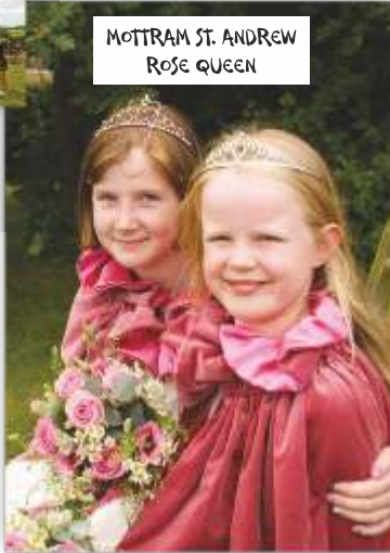
MOTTRAM ST. ANDREW ROSE QUEEN