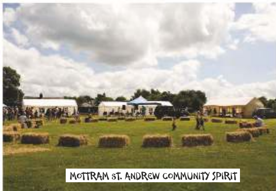
MOTTRAM ST. ANDREW COMMUNITY SPIRIT

A GREAT BIG THANK YOU TO ALL THAT HELPED OUT TO MAKE THIS COMMUNITY EVENT TAKE PLACE.