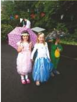
Winners of the Fancy dress