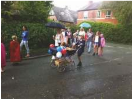
The Queens Birthday Parade