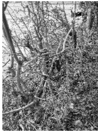
Hedge after treatment