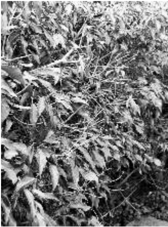
Hedge before treatment

mitigate his previous violent actions. Yet even as he pulls out the last vestiges of green shoots and ivy roots, stragglers from the earlier battle, there seems to filter through the ether those three words favoured by a certain hero (as well it seems by the Ivy), with both their threat and their promise - 'I'LL BE BACK'! - But then so too will - 'THE GARDENER'!! ♦